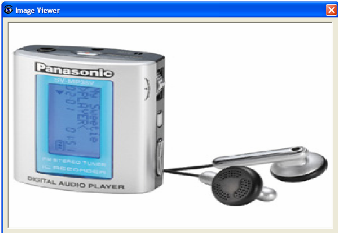
Image Viewer of found items